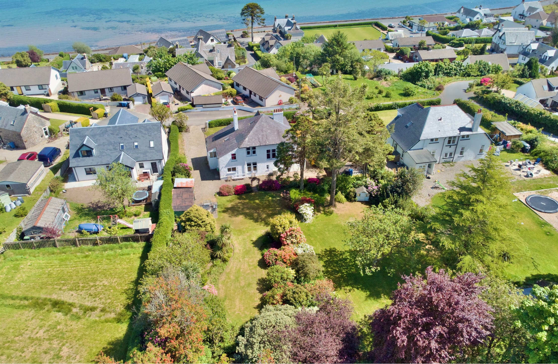
Helenslea Whiting Bay, Isle Of Arran, KA27 8QR