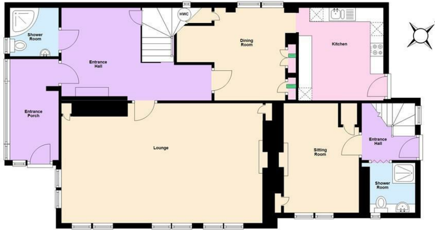
Helenslea Ground Floor